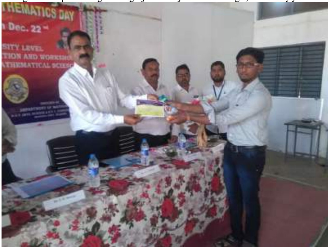
third prize has got Mungsaji Maharaj Science College , Darvha .

And again third prize has got Mungsaji Maharaj Science College , Darvha by juries marking.