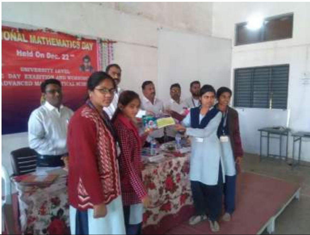
Has got third prize G.S.College , Khamgaon. Dist . Buldana.

And again third prize has got Mungsaji Maharaj Science College , Darvha by juries marking.