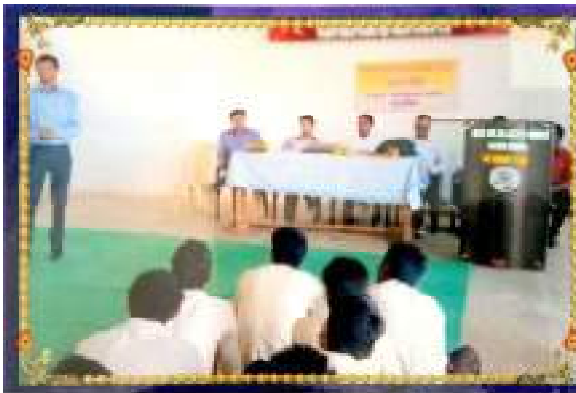
આભિયંત્રણ આયોજીત વિજ્ઞાપનથી પ્રારંભીકરણ અંગેની માહિતી આપવામાં આવી હતી. આયોજીત આયોજીત સમય, આયોજીત.