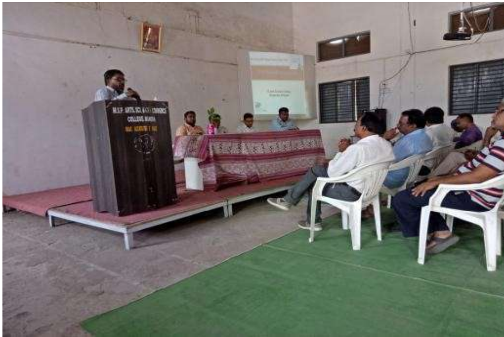
Giving the introductory speech on IPR Workshop