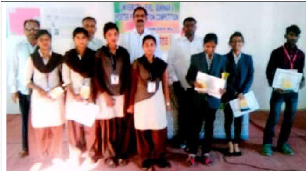
Snapshot with all winners of Seminar & Poster Presentation Competition.