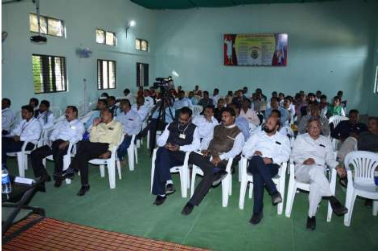
Participants listening to the Resource Person in the seminar.