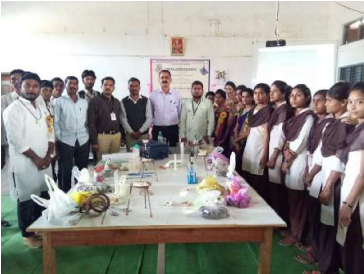
One group photo of workshop taken with principal, Keynote speaker & organizing secretary.