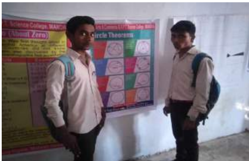
Student of M. S . P College , Manora. has poster presentation .