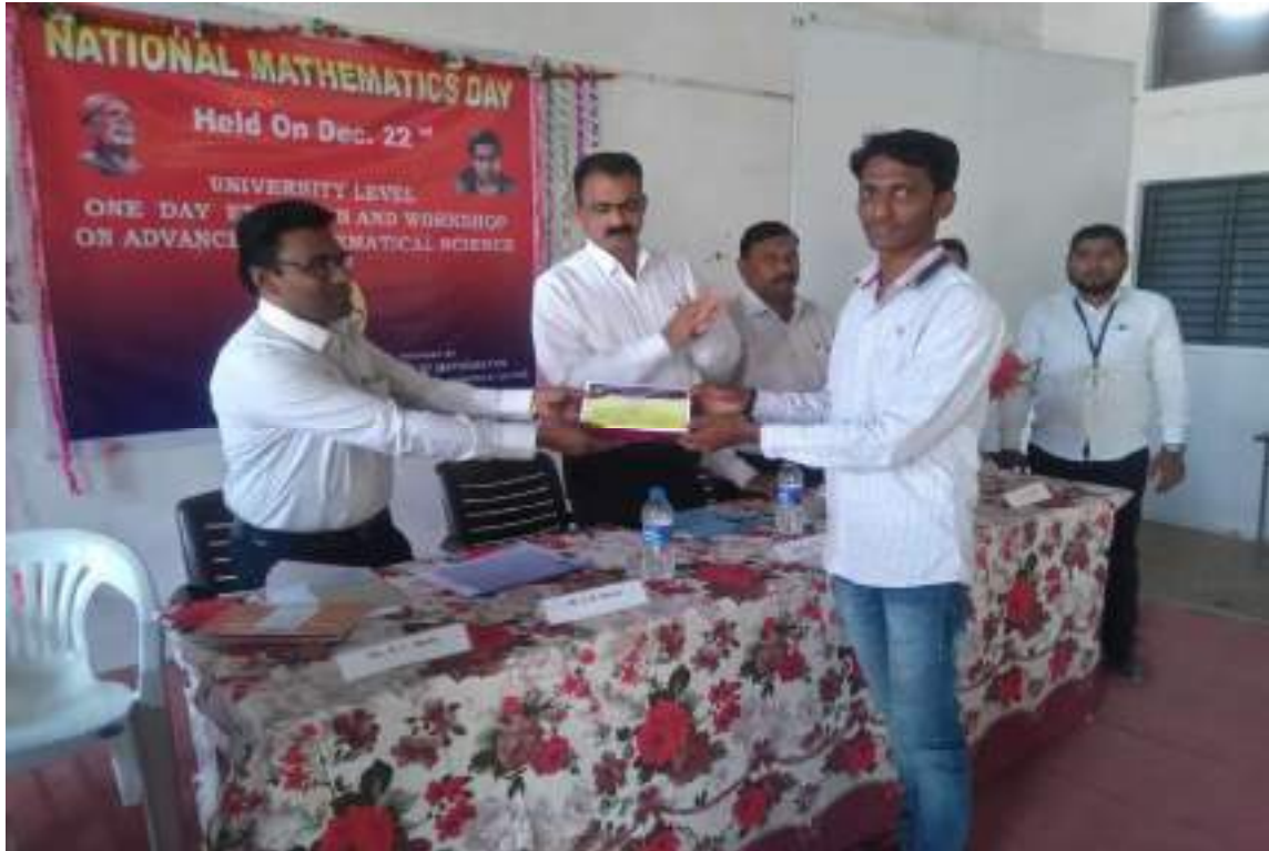
Arni. Dist. Yawatmal.