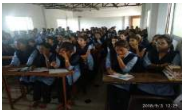
B.Sc. Students attending the workshop.