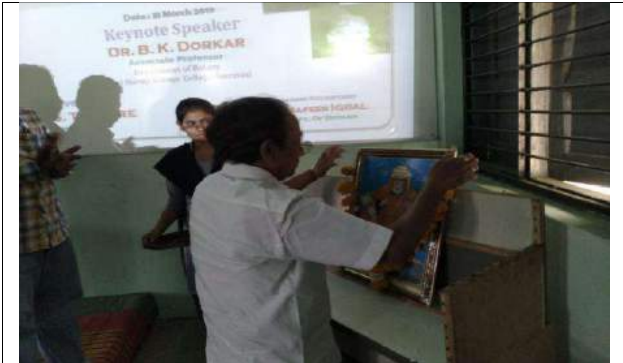
Guest inaugurating the event by garlanding the Sant Gadge Baba portrait